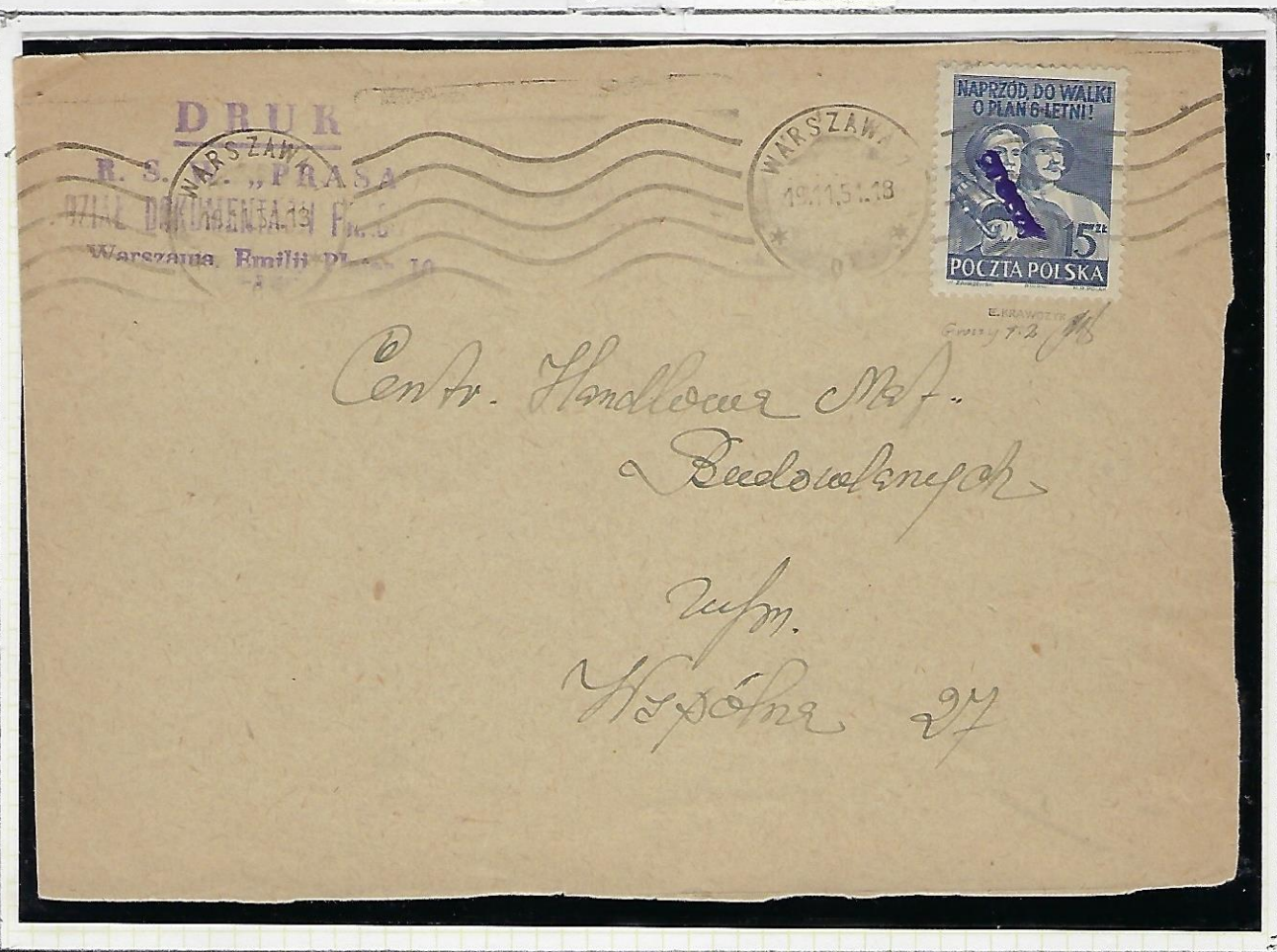
Cover (front only) sent locally from Warszawa-1. on 19.11.51. Ovpt. expertise by E.Krawczyk.