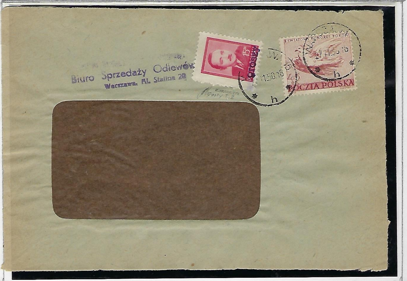
Window cover (front only): sent locally from Warszawa-15 on 27.11.50 using a 15zł Bierut ovpt. and a new 45gr Picasso Peace Dove. Total 60gr.