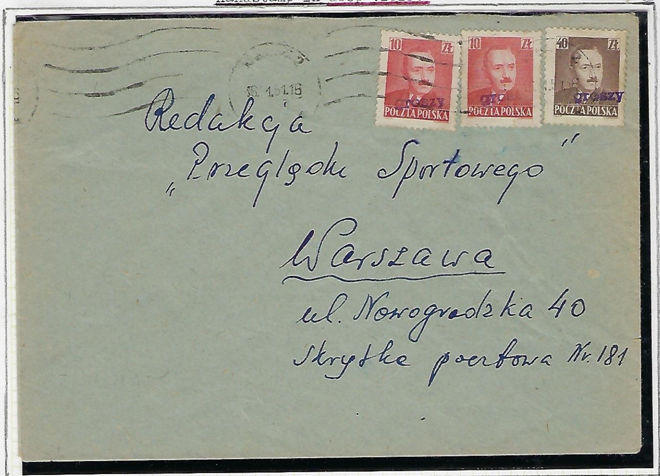
Cover sent 16.1.51 from Gdańsk-2 to Warszawa using correct postage of 60gr new val.

Type 2: GROSZY Gdańsk. Handstamp in deep violet.