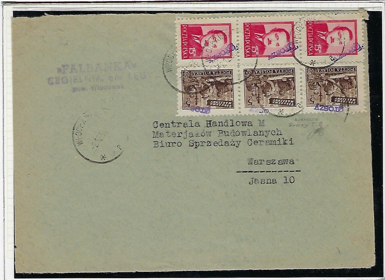
Cover with 60gr new valuta sent 2.12.50 from Włocławek (but with Type-2 stamps) to Warszawa. Expertised by E.Krawczyk. Correct postage.