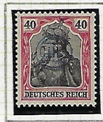
40 (Pf): carmine & black