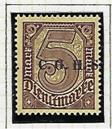
5 Mk: brown-violet on yellow

(3): Opt. on Stamp without Control Number, but New Watermark Wafers.