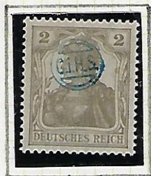
2 (Pf): lt. grey-olive

I: German Stamps with Hand-stamped Overprints in Blue (18 stamps):