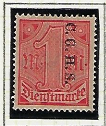
1 Mk: vermilion on salmon