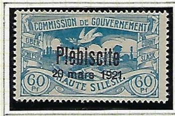
60 Pf: blue