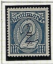
2 Mk: blue