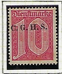
10 (Pf): rose