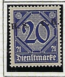
20 (Pf): violet-blue. (overprint displaced)