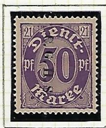
50 Pf: lilac on salmon