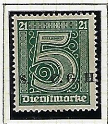
5 (Pf): green. (overprint displaced)

(1): Opt. on Stamps with Control Number "21"; Watermark Diamonds.