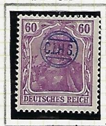
60 (Pf): dark lilac