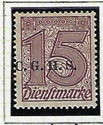
15 (Pf): lilac-brown.