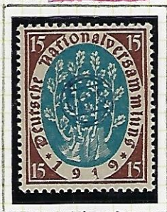
15 (Pf): dark brown & green-blue.