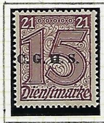
15 (Pf): lilac-brown.