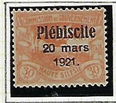
30 Pf: orange