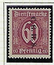
60 (Pf): claret