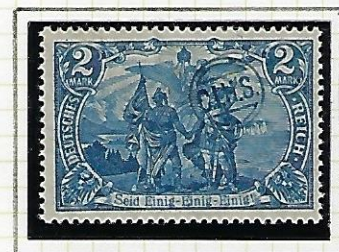
2 Mk.: blue.

Quantities: 2Pf 170; 2½Pf 1380; 3Pf 1400; 5Pf 2220; 7½Pf 1660; 10Pf 1900; 15Pf 2400; 20Pf 2330; 25Pf 40 only; 30Pf 1800; 35Pf 1850; 40Pf 1760; 50Pf 1600; 60Pf 1550; 75Pf 1760; 80Pf 40 only; 1Mk 320; 2Mk 150.