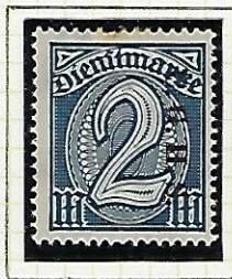
2 Mk: blue.

(3): Ovpt. on Stamp without Control Number. but New Watermark Wafers.