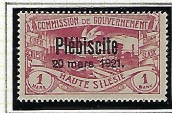
1 Mark: lilac-red