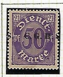
50 Pf: lilac on salmon. (overprint displaced)