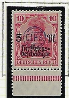
10 + 5 (Pf): carmine-red.