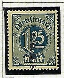
1.25 Mk: blue on yellow