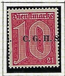
10 (Pf): rose.