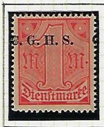
1 Mk: vermillion on salmon