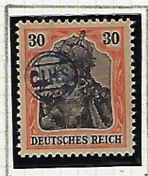
30 (Pf): orange and black.