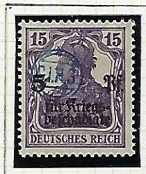
15 + 5 (Pf): blackish violet.