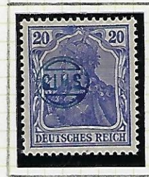
20 (Pf): blue.