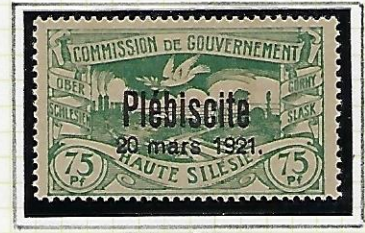
75 Pf: green