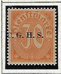
30 (Pf): orange on salmon