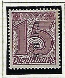
15 (Pf): lilac-brown.