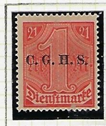
1 Mk: vermillion on salmon.

Notes: This overprint was meant to be printed horizontally, but in fact vertical prints (in both directions) are easily as common. In addition there are double, inverted, double inverted, and displaced overprints which in some cases are as common as the "proper" horizontals. (See subsequent pages).