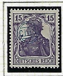
15 (Pf): dark violet.