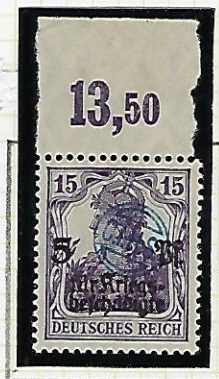
15 + 5 (Pf): blackish violet.

Quantities: 10 + 5 and 15 + 5Pf: 60 each.