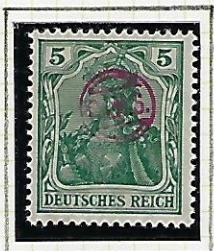
5 (Pf): deep blue-green.

IV: Same overprint on German stamps in Red. (Six stamps):