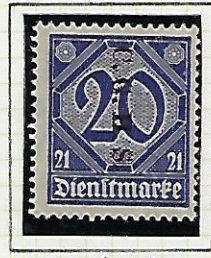
20 (Pf): violet-blue.