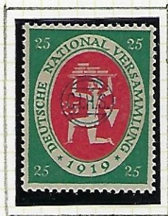
25 (Pf): green & red.