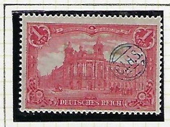
1 Mk.: red.