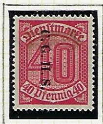
40 (Pf): carmine.