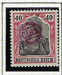
40 (Pf): red-carmine and black.