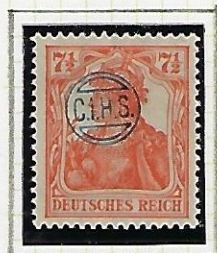
7½ (Pf): orange.