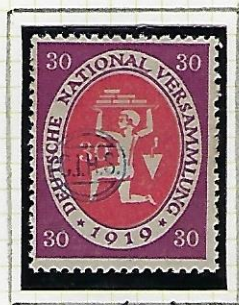
30 (Pf): lilac & carmine.

(b) Authentication by Haertel ("GEPRÜFT M. HAERTEL") :