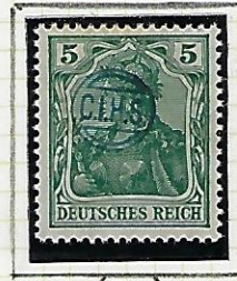
5 (Pf): bluish green.