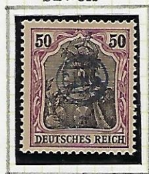
50 (Pf): violet-purple & black on yellow