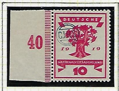
10 (Pf): carmine-red:

(b) Authentication by Haertel ("GEPRÜFT M. HAERTEL") :