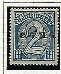
2 Mk: blue