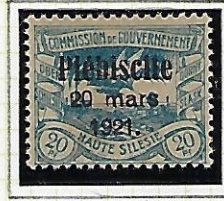
20 Pf: blue