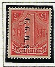
1 Mk: vermilion on salmon