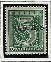
5 (Pf): green

(2): Opt. on Stamps without Control Number; Watermark Diamonds.