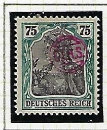
75 (Pf): dark green and black.