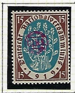
15 (Pf): dark brown and green-blue.

Quantities: 5Pf 70; 15 and 20Pf 200 each; 40 and 75Pf 10 each; 15Pf (II) 100.