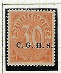
30 (Pf): orange on salmon.