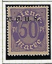
50 Pf: lilac on salmon.