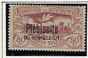
80 Pf: red-brown