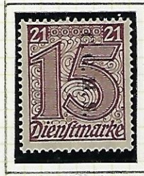
15 (Pf): lilac-brown.