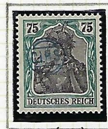
75 (Pf): green & black