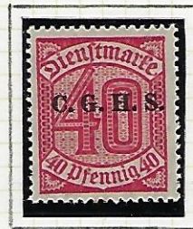
40 (Pf): carmine.