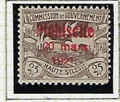
25 Pf: brown