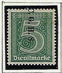
5 (Pf): green

(2): Opt. on Stamps without Control Number. Watermark Diamonds.