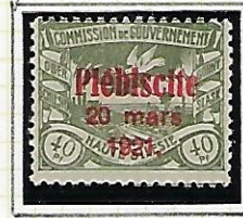
40 Pf: olive-green

The large-size values were overprinted as follows: