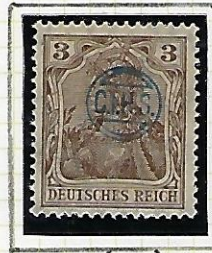
3 (Pf): brown