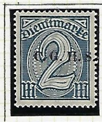
2 Mk: blue.

(3): Opt. on Stamp without Control Number, but New Watermark Wafers.