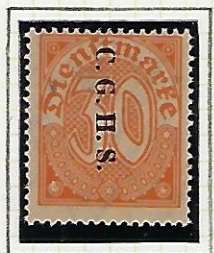
30 (Pf): orange on salmon