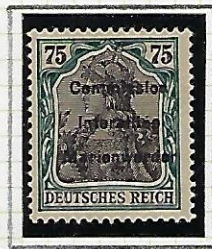
75Pf deep green/ black