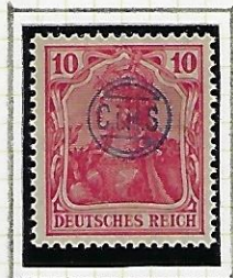
10 (Pf): carmine