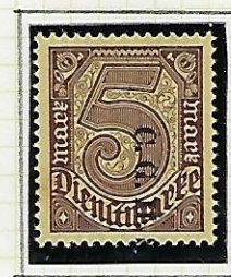
5 Mk: brown-violet on yellow

(3): Ovpt. on Stamp without Control Number. but New Watermark Wafers.