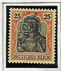
25 (Pf): red-orange & black