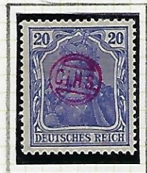
20 (Pf): violet-blue.