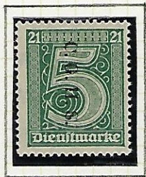
5 (Pf): green

(1): Opt. on Stamps with Control Number "21"; Watermark Diamonds.