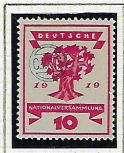
10 (Pf): carmine-red.