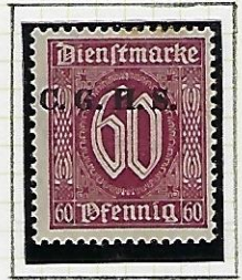
60 (Pf): claret