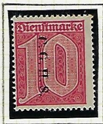
10 (Pf): rose.