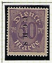
50 Pf: lilac on salmon