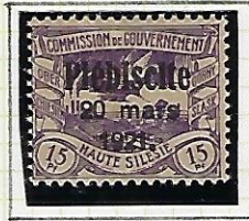
15 Pf: violet