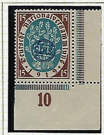
15 (Pf): dark brown & green-blue.