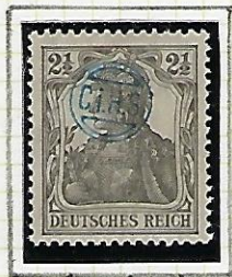
2½ (Pf): olive-grey