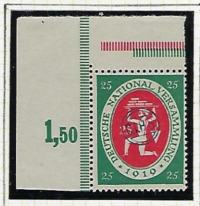
25 (Pf): green & red.