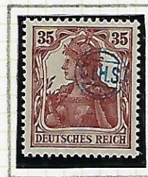
35 (Pf): red-brown.