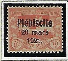
10 Pf: vermillion

The 10, 15, 20, and 30Pf are overprinted in black; 25 and 40Pf in red.