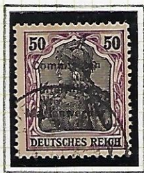
50Pf violet/ black on salmon coloured paper.