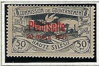
50 Pf: dark grey

The 50Pf was overprinted in red; the others in black.