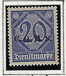
20 (Pf): violet-blue.