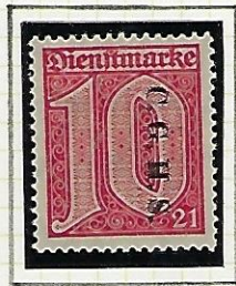
10 (Pf): rose