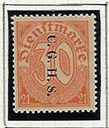
30 (Pf): orange on salmon