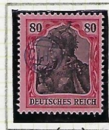
80 (Pf): carmine & black on rose.