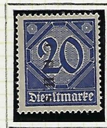
20 (Pf): violet-blue.