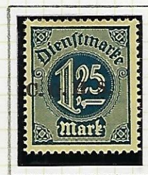
1.25 Mk: blue on yellow