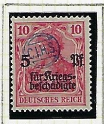
10 + 5 (Pf): carmine-red.