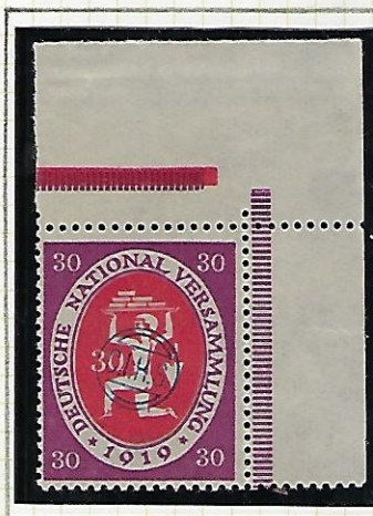
30 (Pf): lilac & carmine.

Quantities : 10Pf 1700; 15Pf 400; 25Pf 150; 30Pf 460.