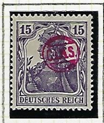
15 (Pf): blackish violet.